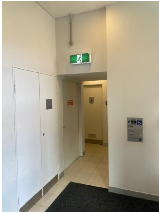
Figure 5 An image of the sliding door to the accessible toilet. Press a green button to open the toilet.