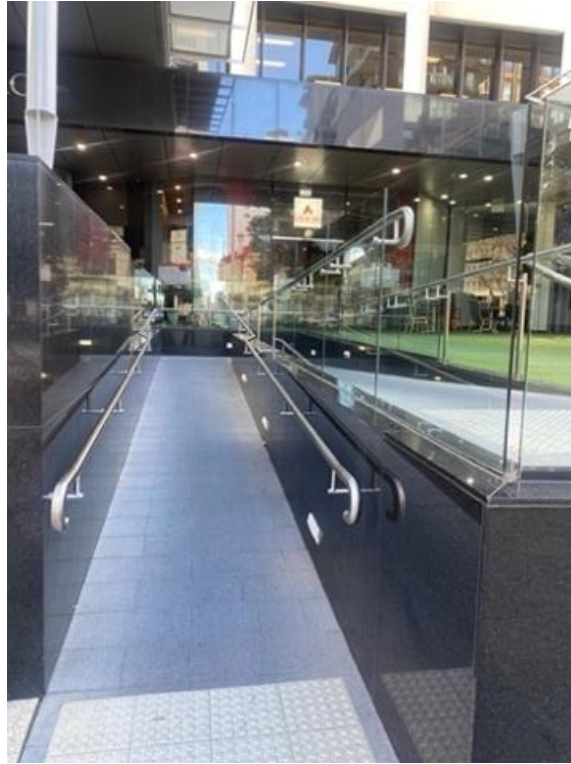
Figure 3 Image of doors to the venue building: