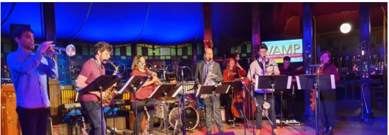
VAMP presented by Drug Aware. 2019.

Next you will need to fill in the online expression of interest form, which you will find a link to at the end of this document, and answer basic questions about your project. After you've submitted your EOI our Project Manager will be in contact to arrange a meeting to go through the application process with you, they will also be able to offer feedback to your draft application and will guide you on how to include health message promotion in your project.